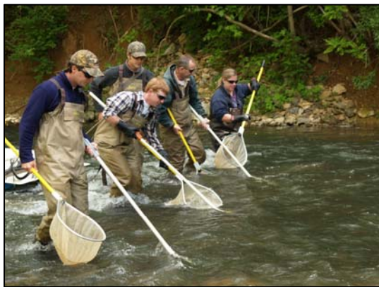
Ecological team members collecting fish after performing electroshocking

Members of the South River Science Team are conducting a six-year ecological study to identify how mercury enters the food web of the South River. The study consists of Phase I (a two-year system characterization) and