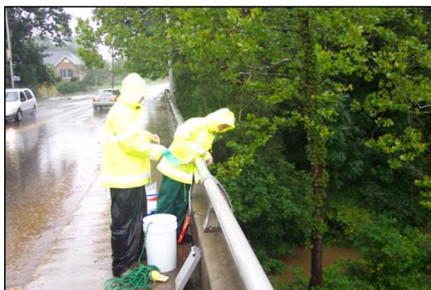
Samplers lowering a pump into the river in preparation for collecting water samples