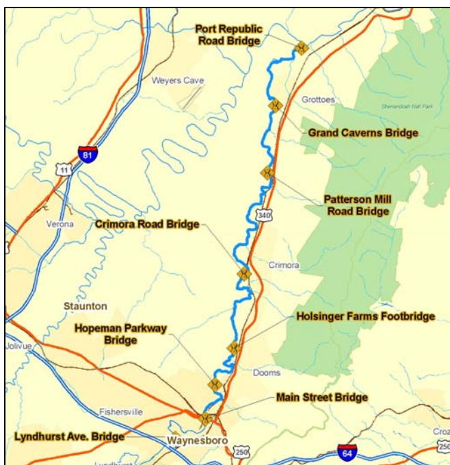
Storm sampling locations along the South River

others and to identify the sources of mercury in those reaches. A “reach” is a defined length of the river. For the purpose of the storm sampling program, the reaches are the distances between bridge sampling locations. Samples are collected from eight bridges over the length of the South River (see map), starting in Waynesboro and extending to Port Republic. Sampling during storm events has many safety challenges because samples are usually collected over a long time period (including night time) and in the rain. Sampling from bridges