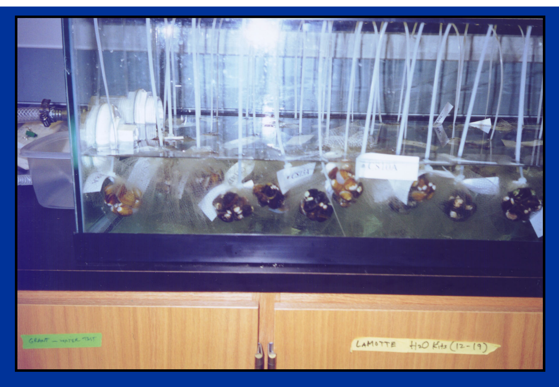
Clams in aquarium at JMU ISAT lab