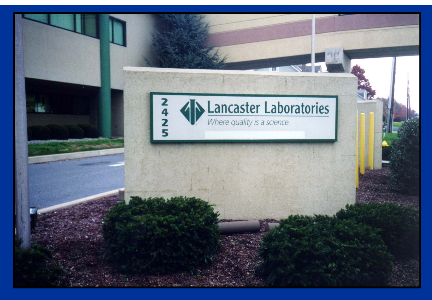
Analytical laboratory for clam samples