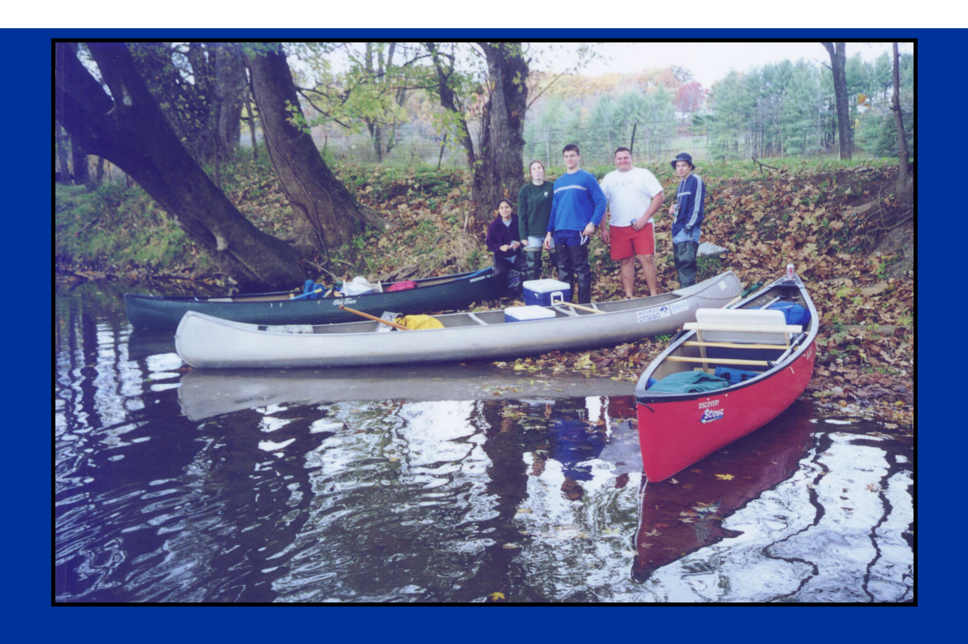
JMU student volunteers and canoes