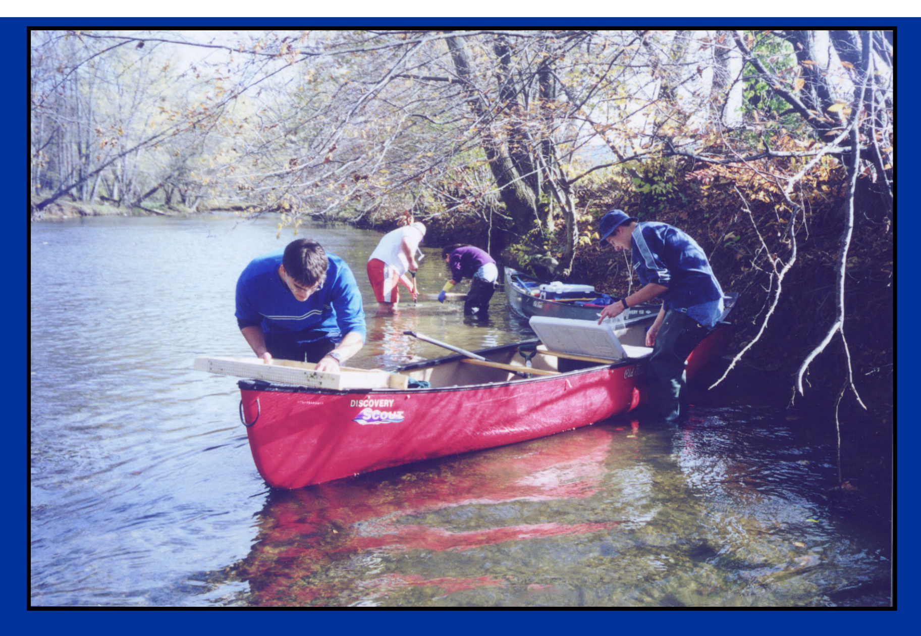
Two sampling crews - November 9, 2002