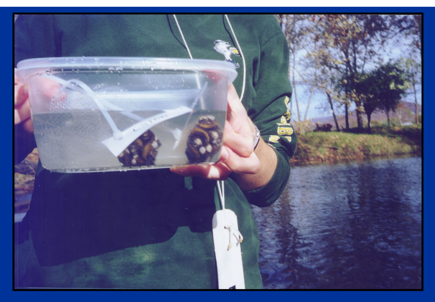
Bagged clams in storage container with river water