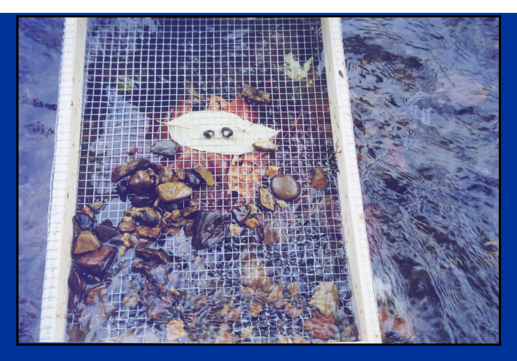
Corbicula on sampling sieve (0.5 inch mesh)