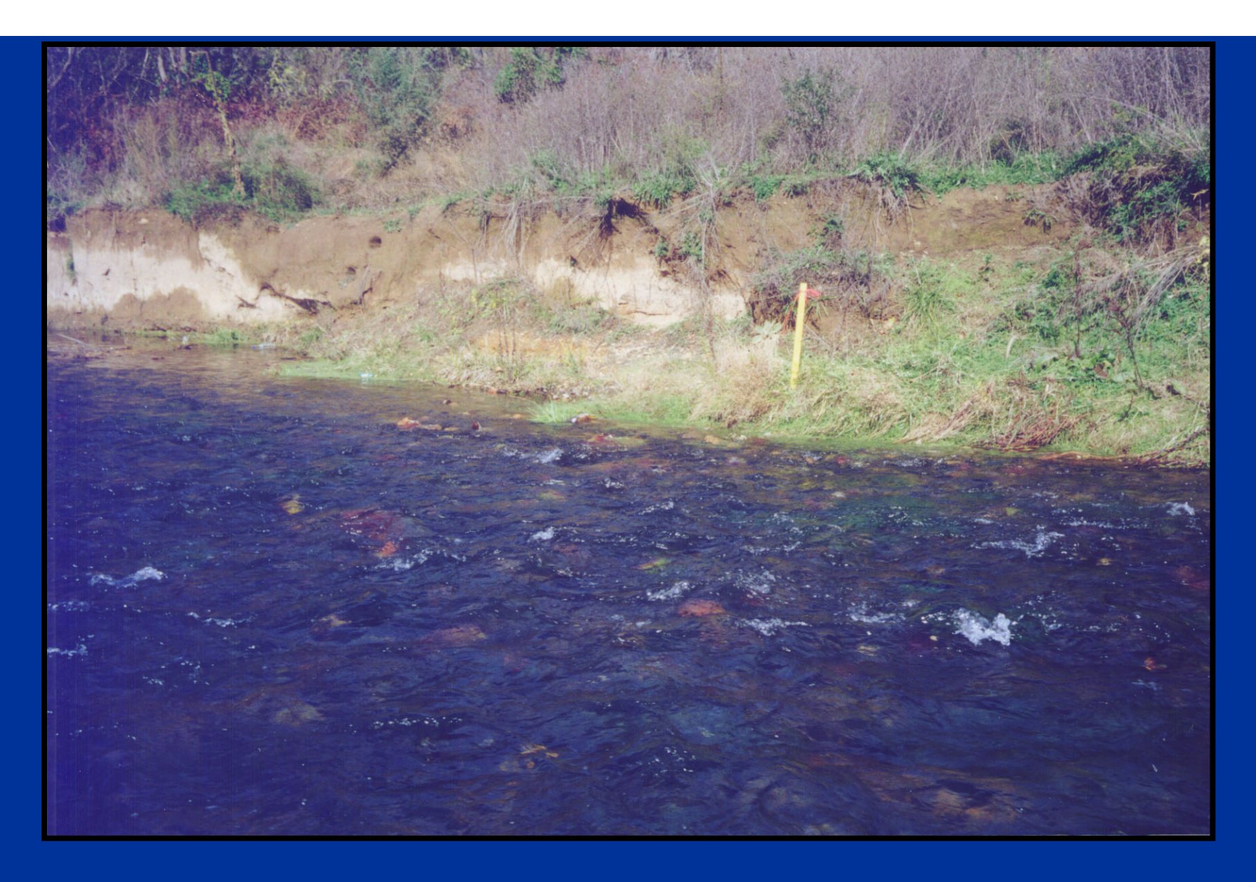
Survey stake marking clam sampling site