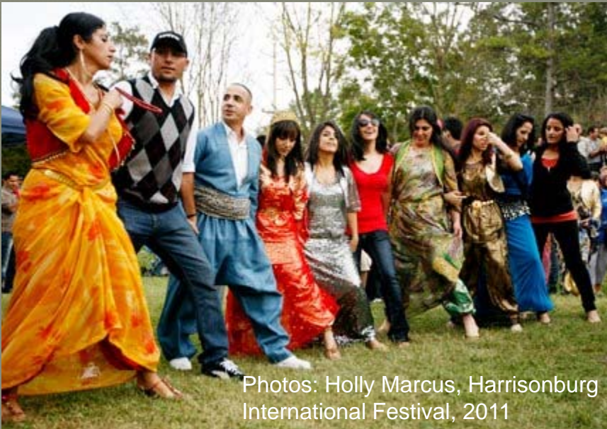
Harrisonburg International Festival, 2011