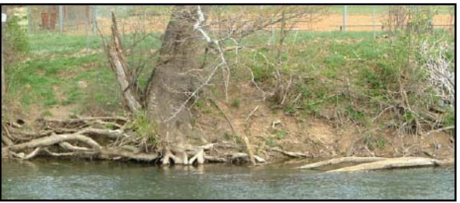
Photograph of a bank on the South River that is targeted for restoration.

vegetation to stabilize the repaired meet with various stakeholders. such as the City of Waynesboro, to refine the design and plans to implement the restoration in Fall 2009.