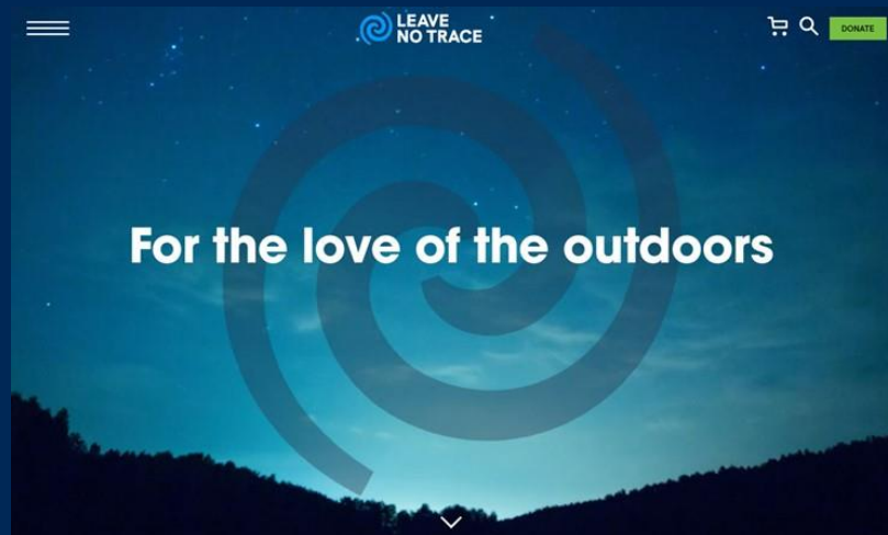
Leave No Trace Homepage