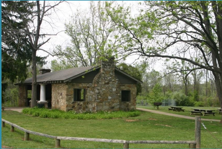
Coyner Springs Park

Promoting interest and collaboration for watershed stewardship